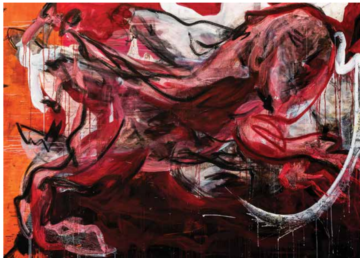
Gala Čaki (Serbia, b.1987)