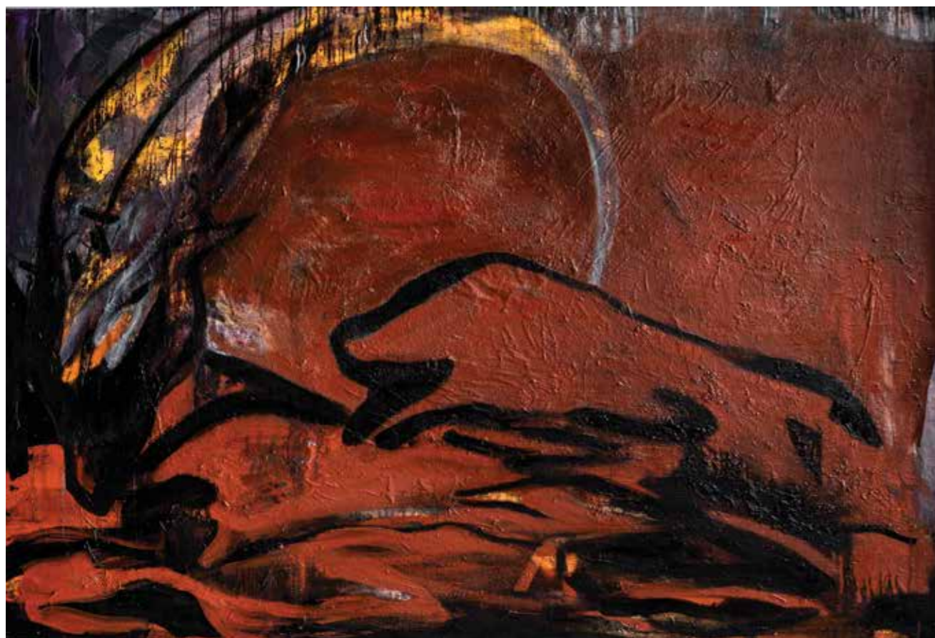
Gala Čaki (Serbia, b.1987)