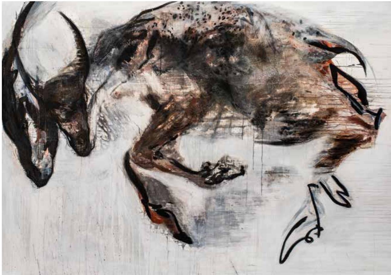
Gala Čaki (Serbia, b.1987)