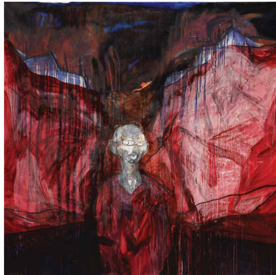
Gala Čaki (Serbia, b.1987)

Red , 2020 160x160cm oil on canvas Serbia