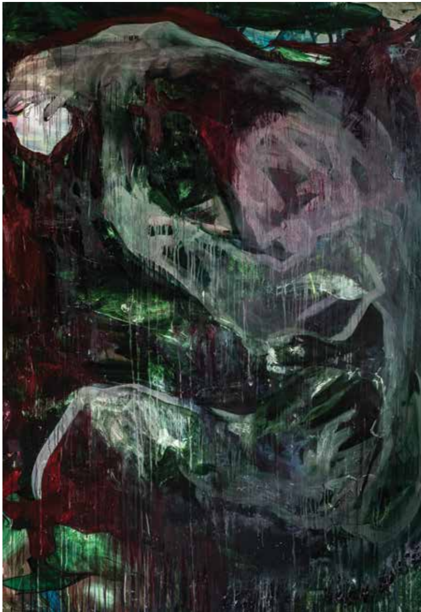
Gala Čaki (Serbia, b.1987)