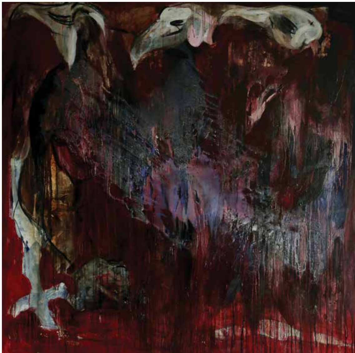
Gala Čaki (Serbia, b.1987)