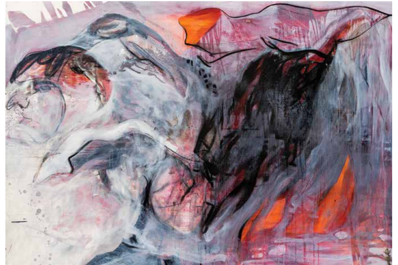
Gala Čaki (Serbia, b.1987)

Twins , 2021 140x200cm oil on canvas Serbia